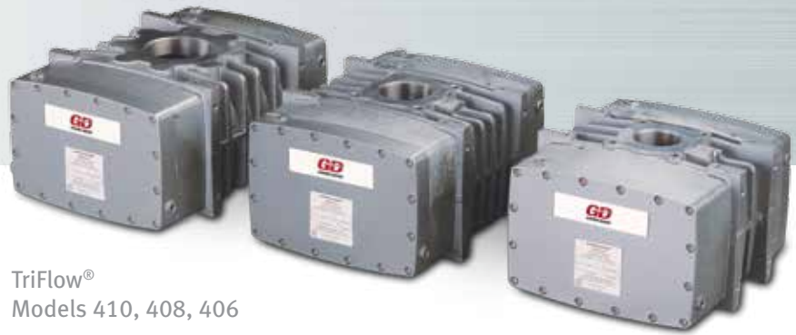
TriFlow® Models 410, 408, 406