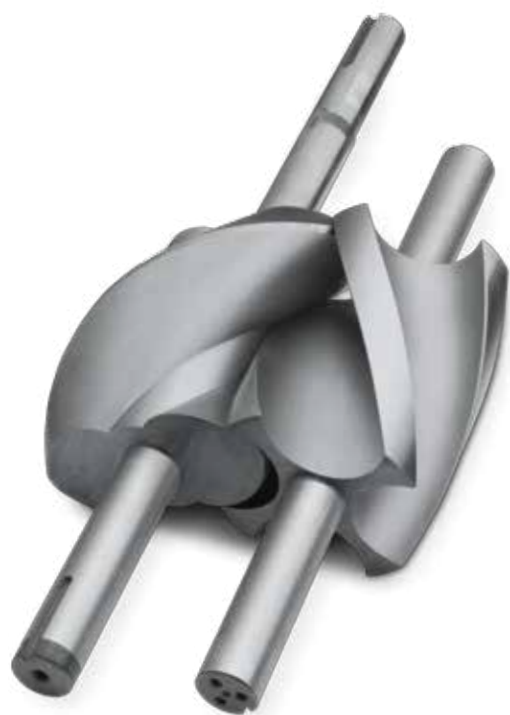
CycloBlower— Industry unique rotor profile

Dimensions shown in inches. Weights are in pounds and approximate.